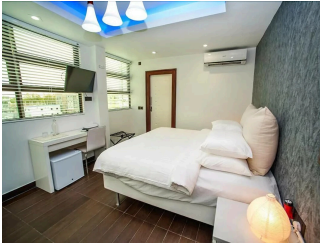
SKY VIEW SUITE