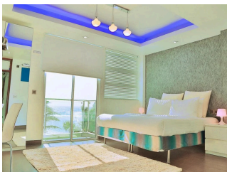
BEACH VIEW SUITE