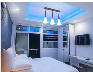
SKY VIEW DELUXE