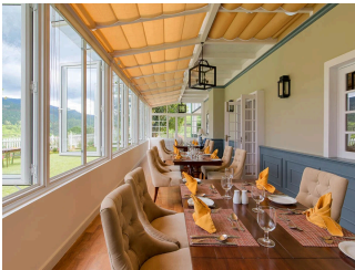
DINING AT LANGDALE

The chefs at the Langdale Boutique Hotel are skilled in crafting exceptional culinary experiences, offering everything from main meals to snacks and High Tea. Guests can select from curated menus or request their favourite dishes, with indoor and outdoor dining options available to enhance the experience. Dining in the garden or enjoying the views from the observation-style dining area adds a unique touch to this Nuwara Eliya destination.