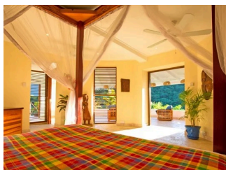
PITON POOL CASUARINA