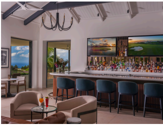
THE NOISY CRICKET BAR