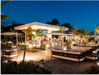
THE 20TH HOLE BAR