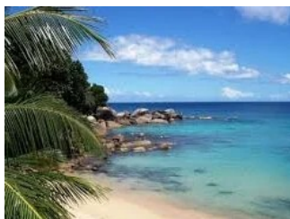
SECRET GARDEN STANDARD GARDEN VIEW