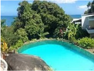
SECRET GARDEN DELUXE WITH VIEW