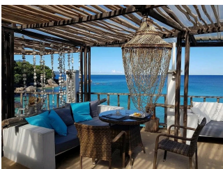
SEASIDE SEA VIEW SUITE