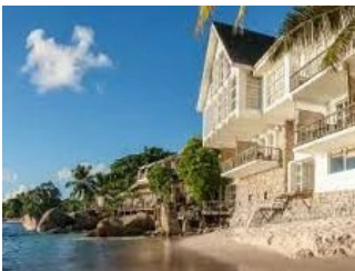
SEASIDE SEA VIEW JUNIOR SUITE