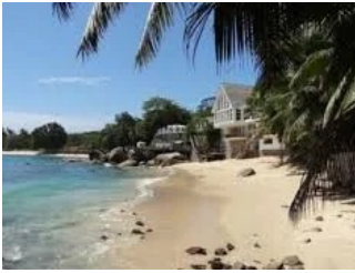
SECRET GARDEN CHARM SUPERIOR VIEW