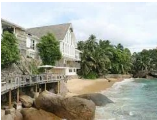
SEASIDE STANDARD SEA VIEW ROOM