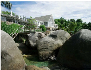
SECRET GARDEN FAMILY ROOM DUPLEX