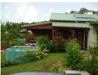
WATER EDGE COTTAGE