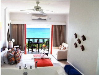
SUNSET OCV JUNIOR SUITE