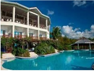
SWIM-UP JUNIOR SUITE