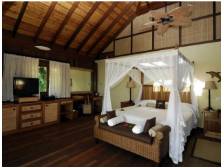
HIDEAWAY OCEAN VIEW VILLA