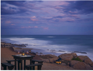
THE BEACH BAR