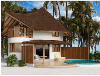
BEACH SUITE WITH POOL