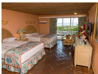
DELUXE OCEAN VIEW ROOM