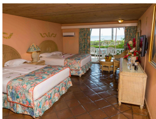
DELUXE OCEAN VIEW ROOM