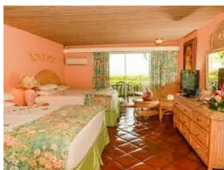
TWO BEDROOM GARDEN VIEW VILLA SUITE