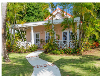
GARDEN VIEW VILLA SUITE