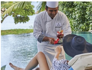
LEGEND POOL BAR