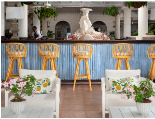
THE BAR AT THE REEF RESTAURANT