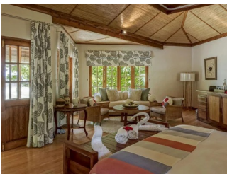
DELUXE BEACH COTTAGE