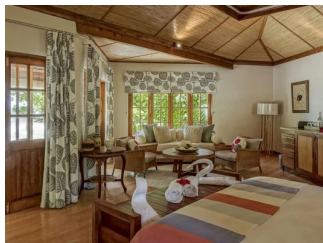
DELUXE BEACH COTTAGE