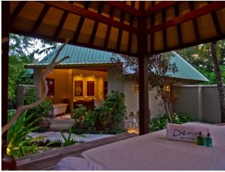
BEACH FRONT SPA COTTAGE