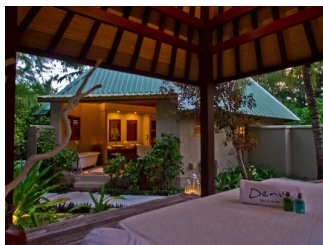
BEACH FRONT SPA COTTAGE