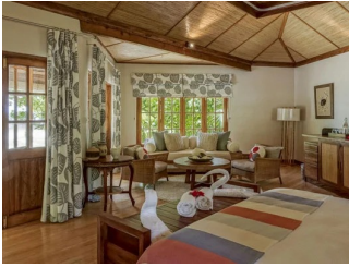
DELUXE BEACH COTTAGE