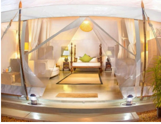
ROYAL LUXURY TENTED SUITE There is one Royal Luxury Tented Suite.