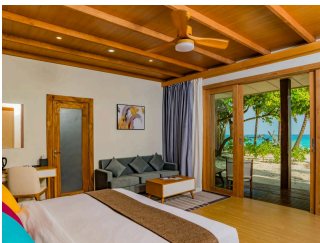
2 BEDROOM FAMILY BEACH VILLA