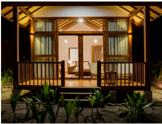
DELUXE GARDEN VILLA