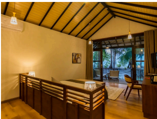
DELUXE BEACH VILLA