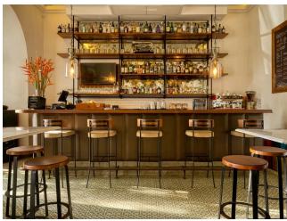
CHURCH STREET SOCIAL - THE BAR