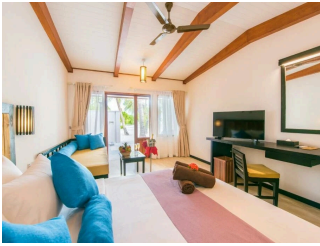
SUPERIOR BEACH FRONT ROOM