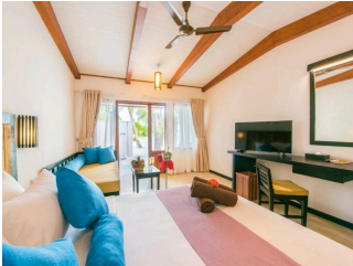
DELUXE BEACH VILLA