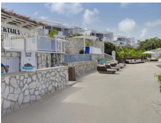
ON THE ROCKS BAR