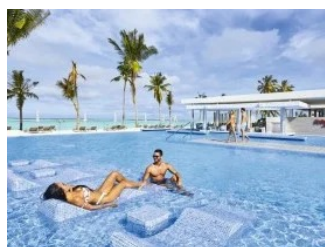
OVERWATER JUNIOR SUITE SUPERIOR