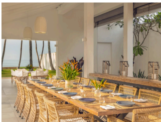
DINING AT TALPE

One long dining table where meals are served, and guests are welcome to bring their own alcohol, which we will gladly be served for them.