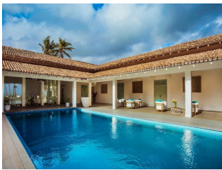
5 BEDROOM VILLA

Ishq Talpe is a full-service villa, with 9 staff on-site including a villa manager, chefs, butlers and housekeepers. The villa has a 12m pool, jacuzzi, library and entertainment room with Satellite TV, PlayStation 5, Nintendo Switch, board games, card games, unlimited access to Netflix and Apple TV.