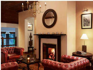
ROAD HOLE BAR