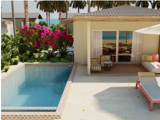
BEACH SUITE WITH POOL