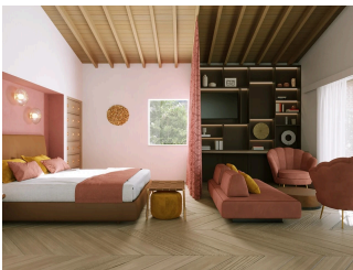
FAMILY BEACH VILLA