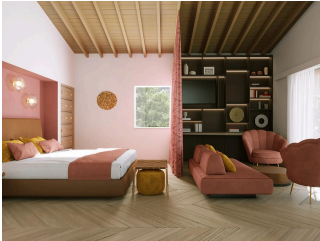
FAMILY BEACH VILLA