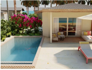
BEACH SUITE WITH POOL