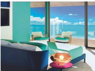
LAGOON SUITE POOL