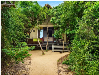
JUNGLE CLUSTER CABIN