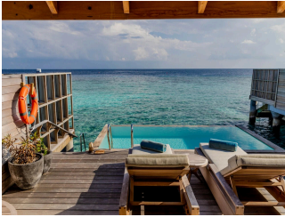
LAGOON POOL VILLA