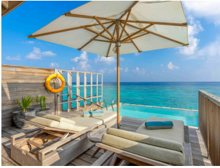
OCEAN POOL VILLA