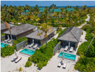
BEACH POOL VILLA