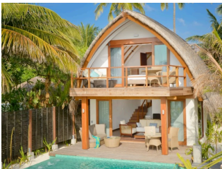
DUPLEX POOL VILLA

The pool villas include an open-air bathroom with freestanding bath and outdoor garden shower, a large veranda with daybed, a 9 sqm pool and dining area.