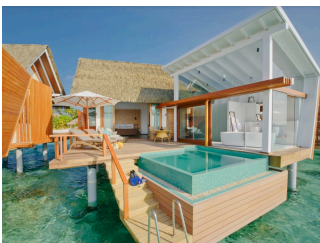
OCEAN POOL VILLA

Located over the water, the ocean villas feature private sundecks, a lagoon-facing bathroom with jacuzzi and direct access to the sea.