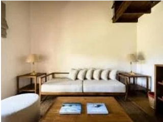
PALM SUITE WITH JACUZZI