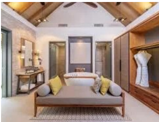
PALM RESIDENCE WITH JACUZZI