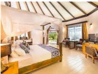
TWO BEDROOM ROYAL BEACH SUITE WITH INFINIY POOL