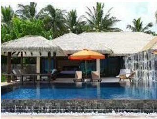
PRESTIGE BEACH VILLA WITH PRIVATE POOL