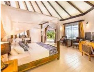
TWO BEDROOM ROYAL BEACH SUITE WITH INFINIY POOL