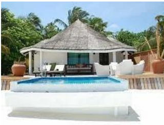
PRESTIGE TWO BEDROOM BEACH SUITE WITH PRIVATE POOL