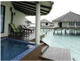
WATER SUITE WITH PLUNGE POOL