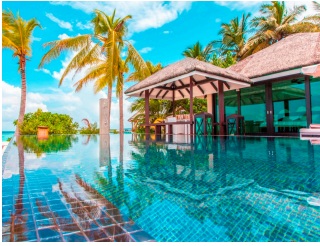
THE KIHAA SIGNATURE RESIDENCE