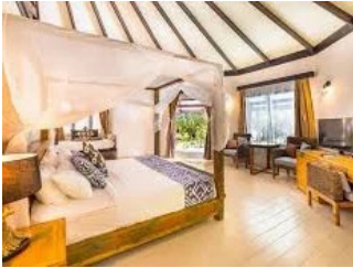
TWO BEDROOM PRESTIGE WATER SUITE