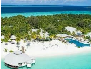
TWO BEDROOMS MALDIVIAN SUITES WITH TWO POOLS