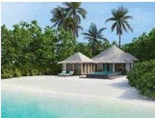
TWO BEDROOM PRESTIGE WATER SUITE WITH INFINITY POOL