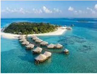
TWO BEDROOMS FAMILY BEACH VILLA