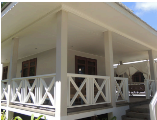
DUPLEX PRIVATE VILLA