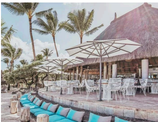
LE MORNE BEACH BAR