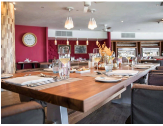
VAN DER STEL WINE BAR