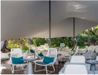
THE MEDINE BAR