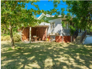
LA MAISON DU POTAGER