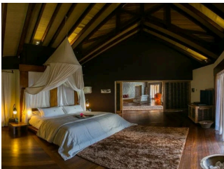
PRESIDENTIAL VILLA ILE DABONDANCE