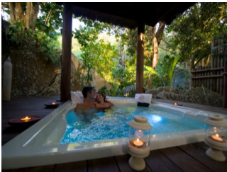
VILLA DE CHARME ELEGANCE