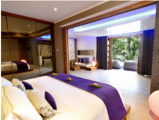
GARDEN SUITE RESIDENCE