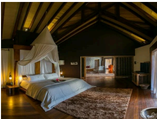
PRESIDENTIAL VILLA ILE DABONDANCE