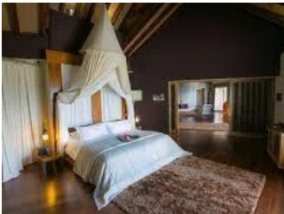
VILLA DE CHARME ELEGANCE SUPERIEUR