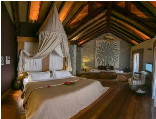
VILLA DE CHARME