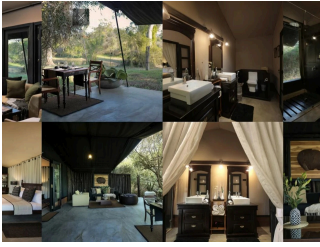
TENTED SUITE WITH POOL