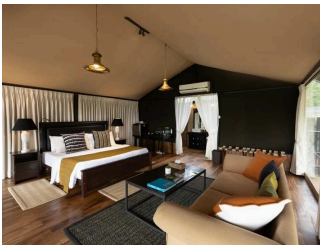
LEOPARD TRAILS POOL SUITES