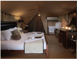
THE DELUXE TENT