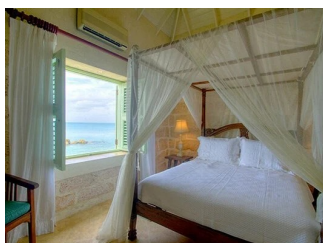
3-BEDROOM OCEAN FORT SUITE