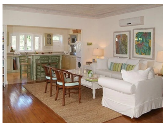
3-BEDROOM VINEYARD GARDEN SUITE