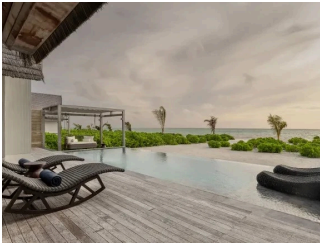
SERENE POOL VILLA SUNSET VIEW