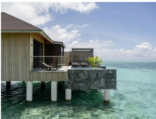
AQUA POOL VILLA SUNRISE VIEW