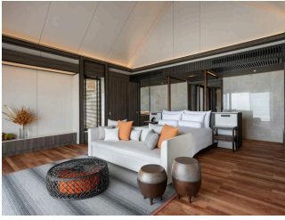
SERENE POOL VILLA SUNRISE VIEW