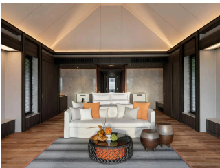
GRAND MADIFUSHI SERENITY POOL VILLA