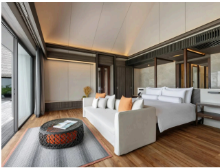
TWO BEDROOM SERENE POOL VILLA