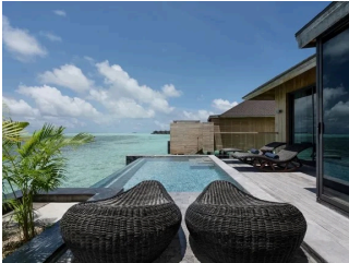
AQUA POOL VILLA SUNSET VIEW