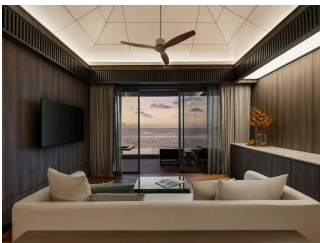
GRAND MADIFUSHI AQUA POOL VILLA