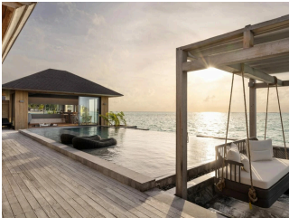
TRANQUIL AQUA POOL VILLA