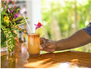
MONTPELIER BEACH BAR