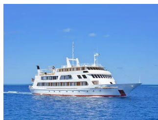
LOWER MAIN DECK