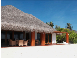
PRESIDENTIAL SUITE (2 BEDROOMS)