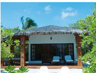
DELUXE SUNSET VILLA