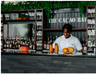
THE CACAO BAR