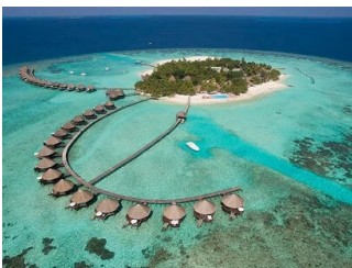
OVER WATER POOL VILLA