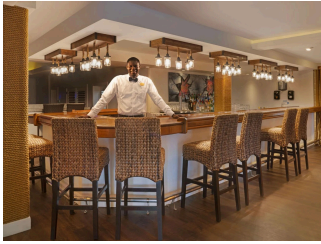
BARS & LOUNGES