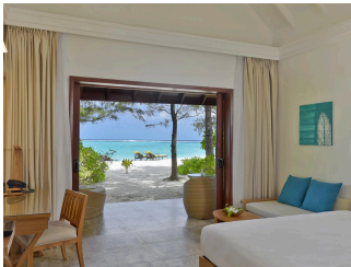
PREMIUM BEACH VILLA