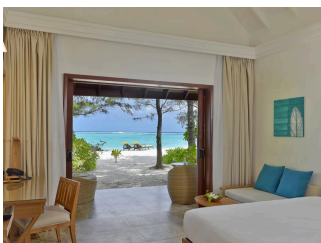
PREMIUM BEACH VILLA