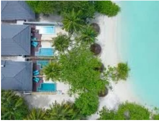
BEACH POOL VILLA