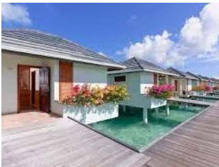
LAGOON BEACH VILLA