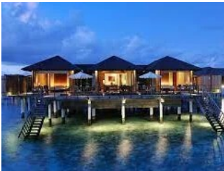
DELUXE BEACH POOL VILLA