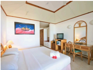
BEACH VILLA WITH WHIRLPOOL