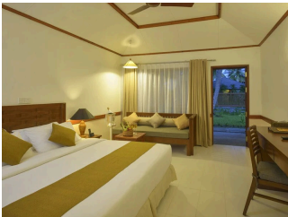
TWO BEDROOM BEACH POOL VILLA