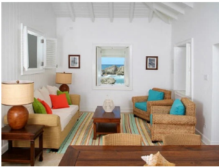
TWO BEDROOM COTTAGE OCEANVIEW