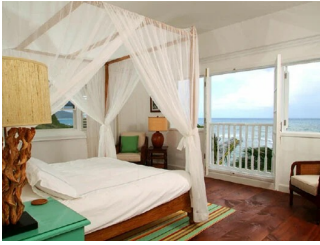
ONE BEDROOM COASTAL VIEW