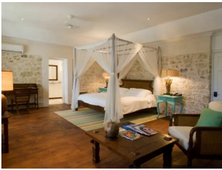
ONE BEDROOM OCEANFRONT

These four suites directly facing the Atlantic Ocean. Suitable for 1-2 guests.